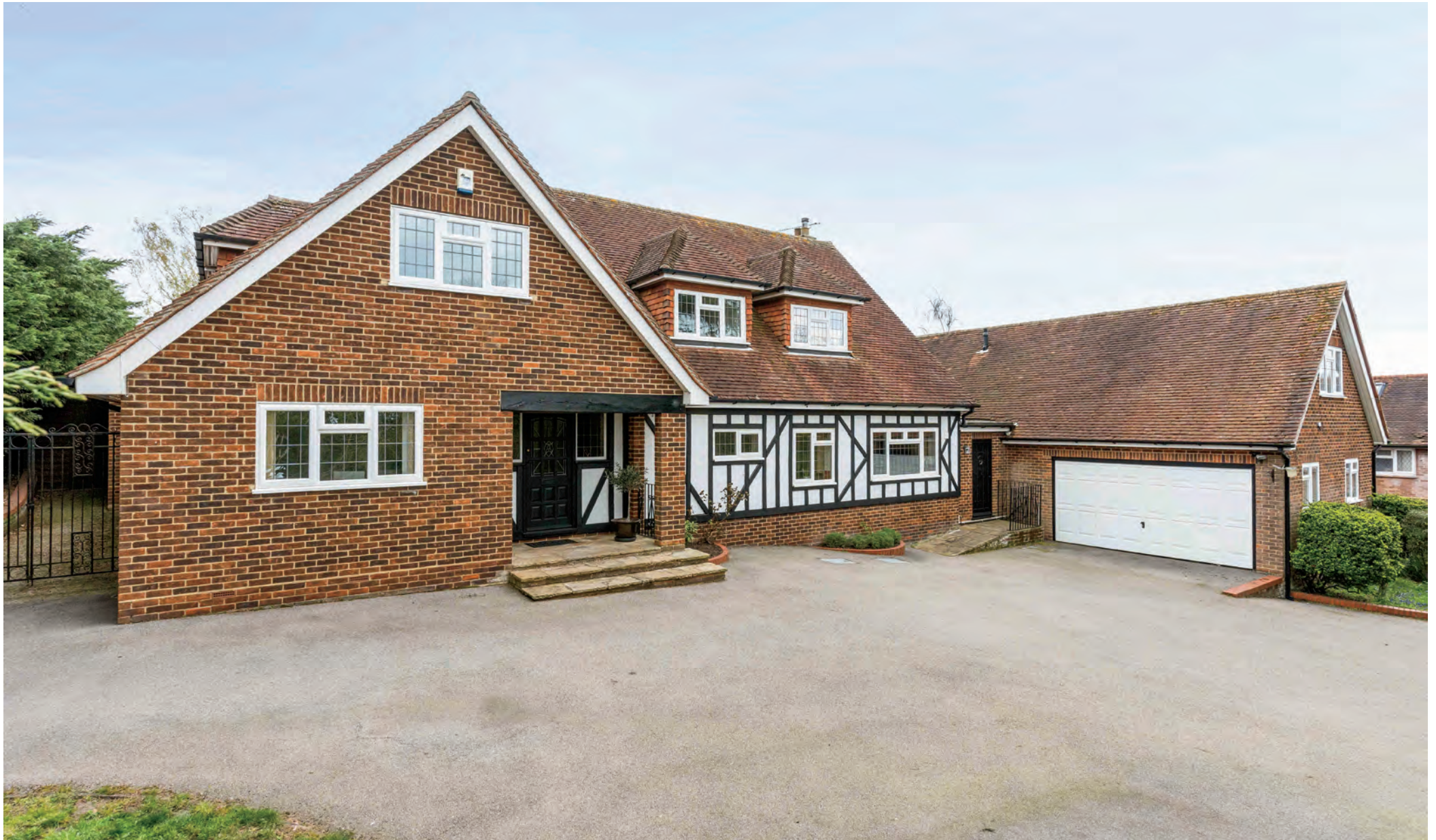
Tilehurst Well Lane | Danbury | Chelmsford | Essex | CM3 4AB