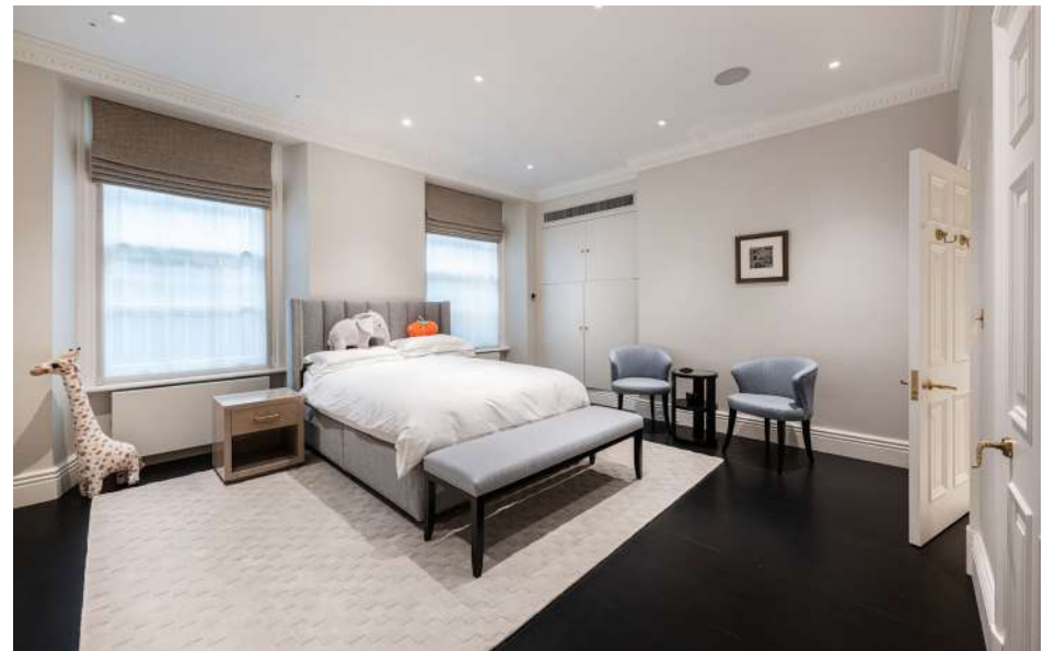
The spacious second bedroom also benefits from custom built-in cupboards, walk-in wardrobe, and a magnificently designed en suite bathroom with stunning granite surfaces.