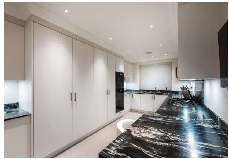
Custom Mowlem & Co. kitchen, featuring a Gaggenau multi-function gas cook top with speciality Wok fitting, and beautiful granite surfaces.