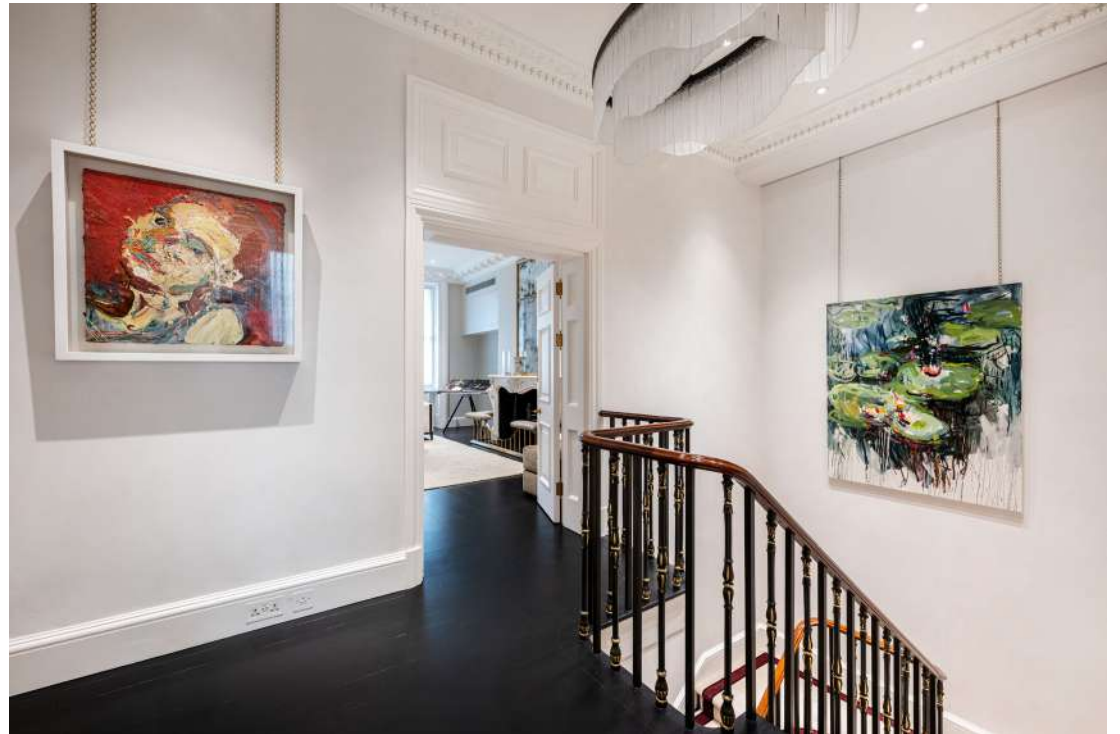
The entrance hall leads to the primary reception room and luxurious master suite, featuring a 7 metre drop to the lower floor following the grand staircase.