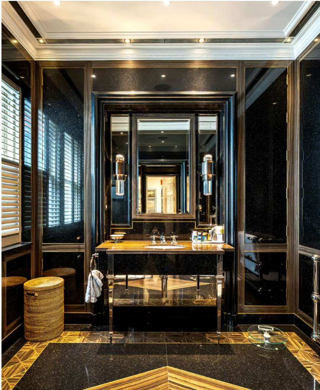
Off the master bedroom, a dressing room featuring bespoke cedar drawers and an opulent en suite bathroom.