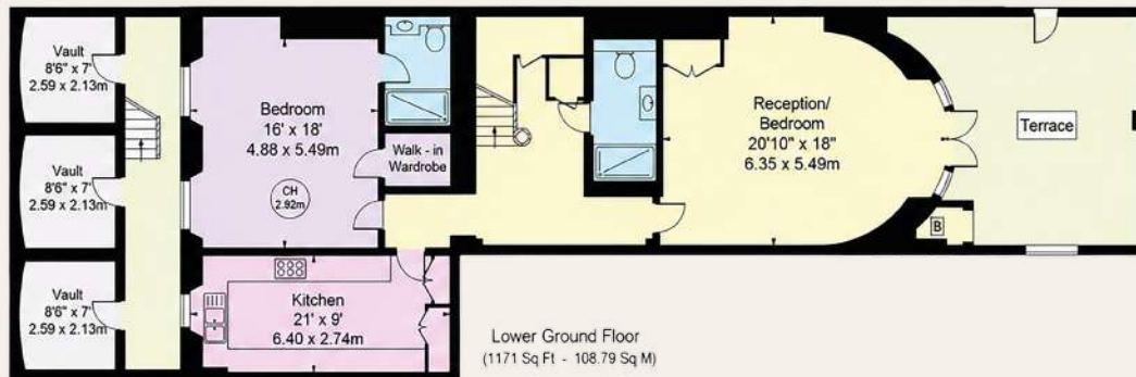
Lower Ground Floor (1171 Sq Ft - 108.79 Sq M)

APPROX. GROSS INTERNAL AREA: 2,320 SQ. FT (215.54 SQ. M) APPROX. INTERNAL AREA OF VAULTS: 178 SQ. FT (16.55 SQ. M) APPROX. EXTERNAL AREA OF TERRACE: 258 SQ. FT (23.79 SQ. M)