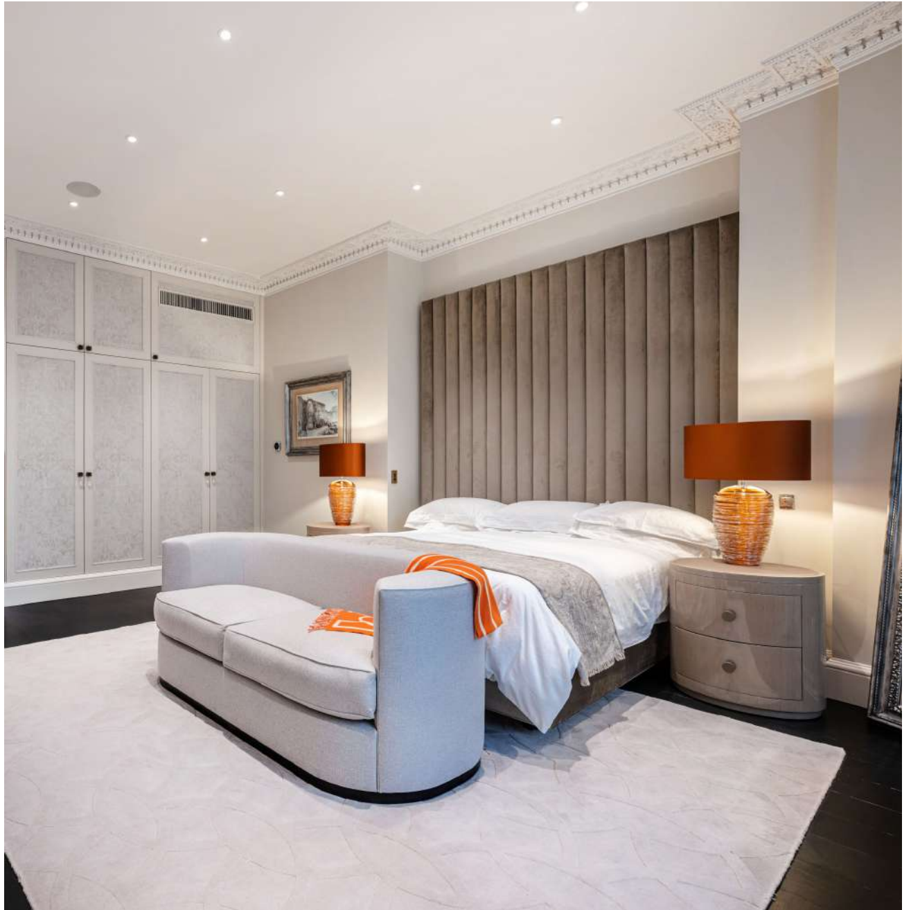
The master bedroom boasts generous bespoke built-in wardrobes, with a floor-to-ceiling bow-fronted window and luxurious materials and fittings