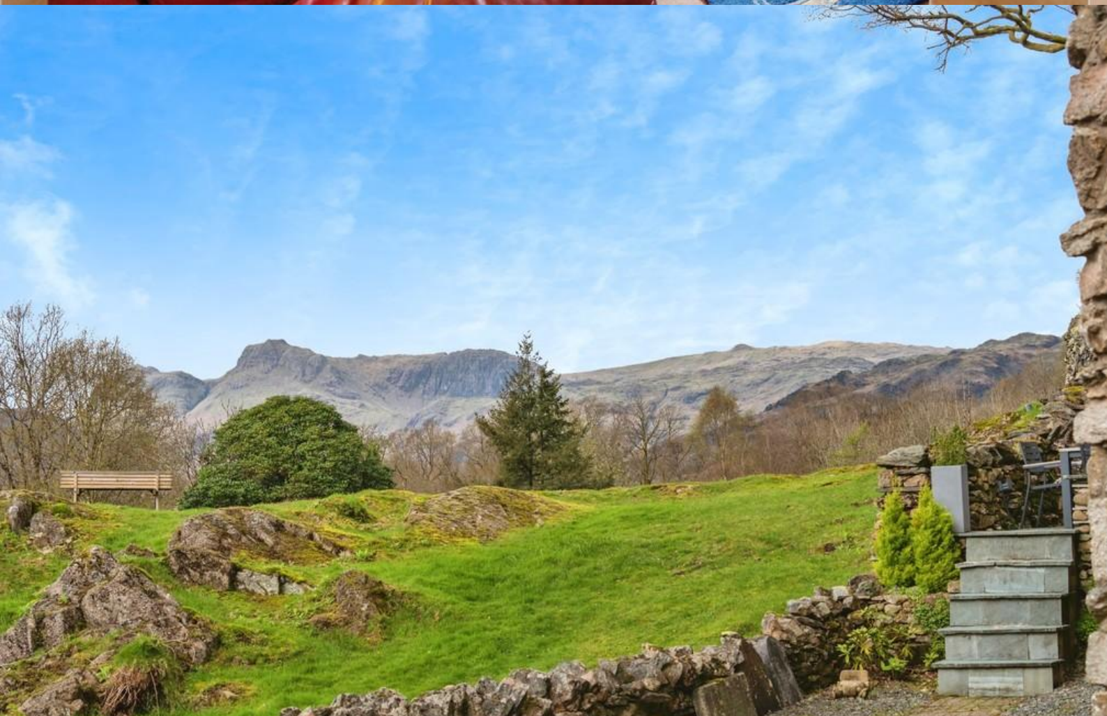
View from seating area