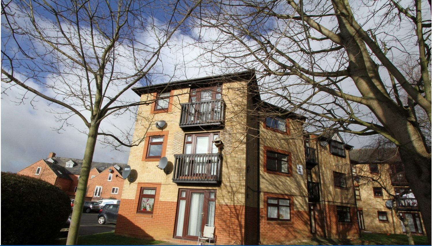
NORTHUMBERLAND COURT, DUKE STREET, BANBURY, OXON, OX16 4NJ £925pcm

Telephone: 01295 275909 • Email: info@steppingstonesletting.com