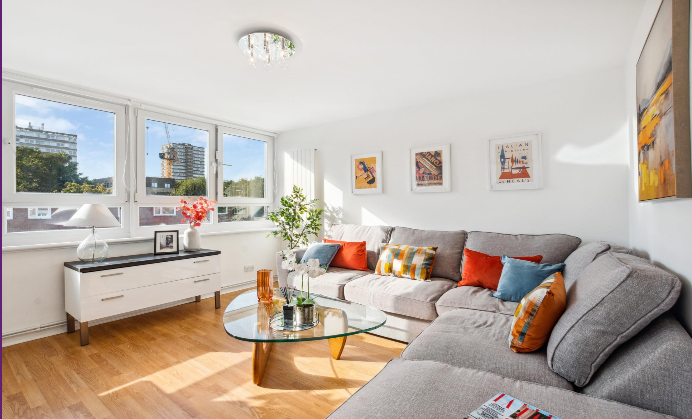
Musgrave Court 110 Battersea Bridge Road, SW11