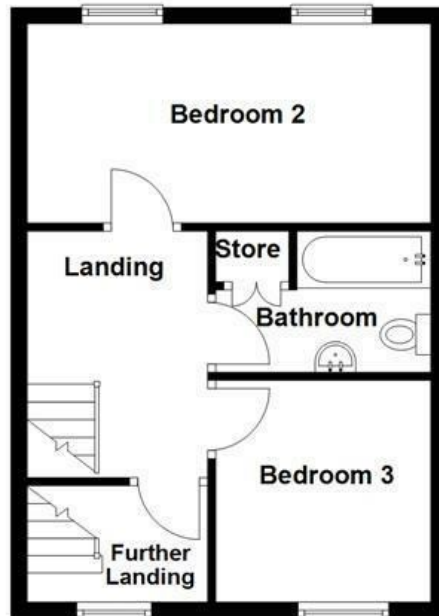
First Floor Approx. 35.4 sq. metres (381.4 sq. feet)