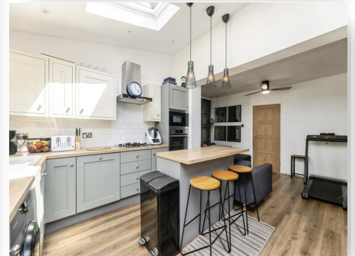
Acre Grove, Leeds LS10 4EN