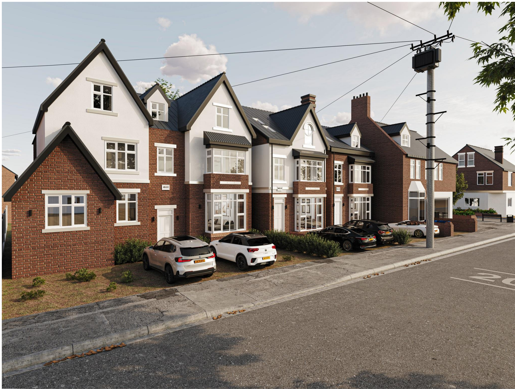
Trent Boulevard, West Bridgford Nottingham NG2 5BB