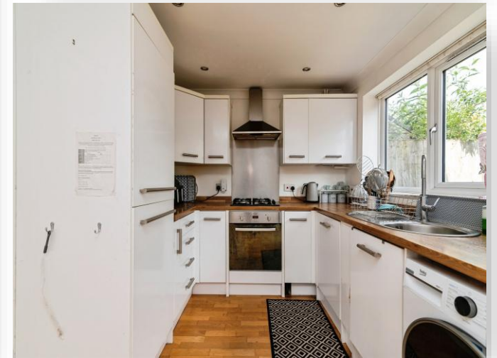
Ashness Close, Gamston Nottingham NG2 6QW