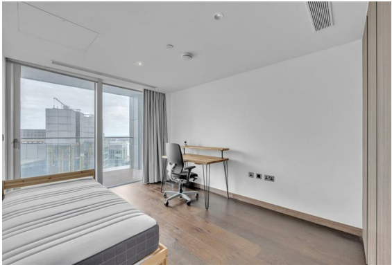
Dahlia House, North Wharf Road, London, W2 1AW