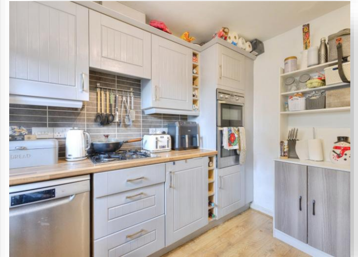
Patenall Way, Higham Ferrers NN10 8PL