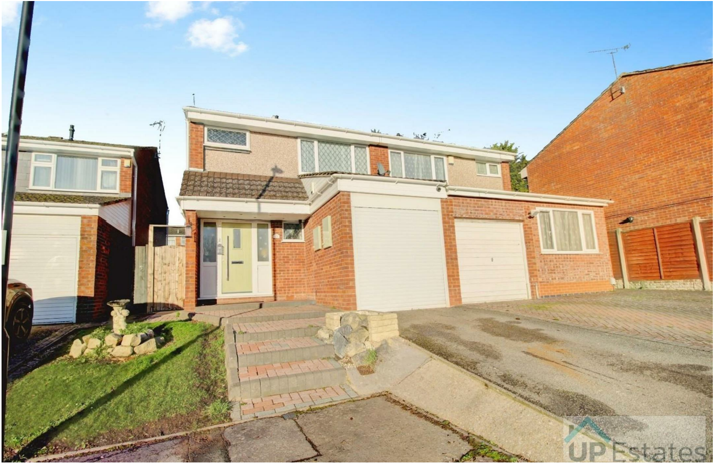
Warmwell Close, Coventry