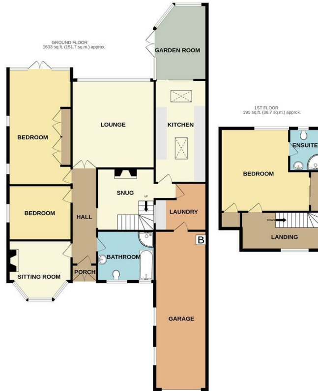
TOTAL FLOOR AREA: 2029 sq.ft. (188.5 sq.m.) approx. Whilst every attempt has been made to ensure the accuracy of the floorplan contained here, measurements of doors, windows, rooms and any other items are approximate and no responsibility is taken for any error, omission or mis-statement. This plan is for illustrative purposes only and should be used as such by any prospective purchaser. The services, systems and appliances shown have not been tested and no guarantee as to their operability or efficiency can be given. Made with Metropix ©2026

IMPORTANT NOTICE: 1. No description or information given whether or not these particulars and whether written or verbal (information) about the property or its value may be relied upon as a statement or representation of fact. Grove Properties Group do not have any authority to make representation and accordingly any information is entirely without responsibility of the part of Grove Properties Group or the seller. 2. The photographs (and artists impression) show only certain parts of the property at the time they were taken. Any areas, measurements or distances given are approximate only. 3. Any reference to alternations to, or use of any part of the property is not a statement that any necessary planning, building regulations or other consent has been obtained. 4. No statement is made about the condition of any service or equipment or whether they are year 2000 compliant.