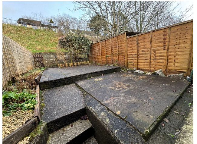
REAR PATIO GARDEN