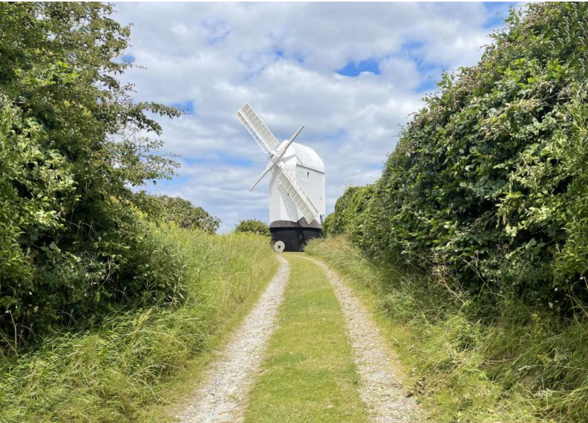
Pictured is 'Jill', of Jack and Jill Windmills located on the South Downs, Clayton.