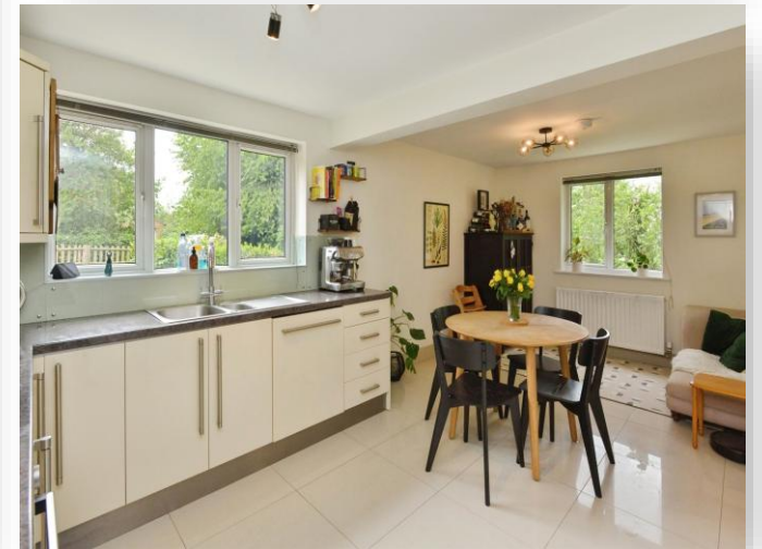
Greatchesters, Bancroft Milton Keynes MK13 0PD