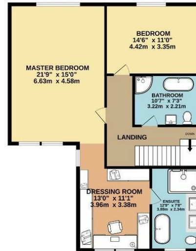
1ST FLOOR 973 sq.ft. (90.4 sq.m.) approx.