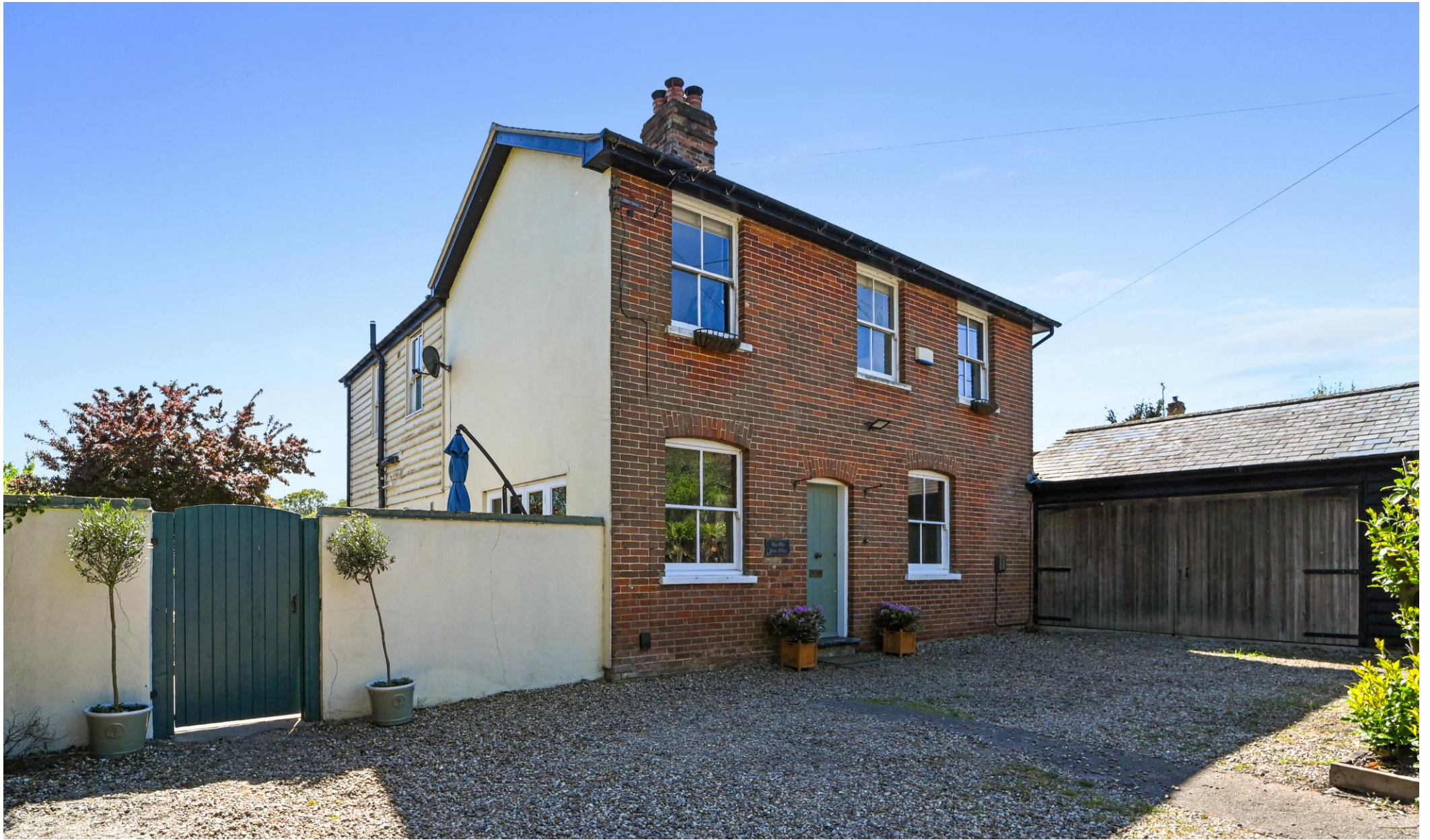
Old Post Office Honey Tye | Leavenheath | CO6 4NX