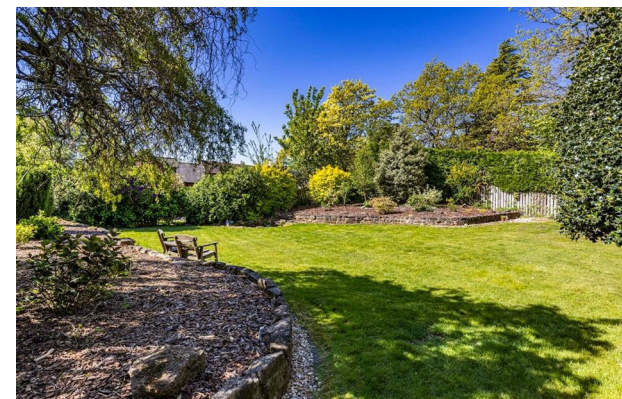
Middle Close, Mansfield Road, Farnsfield, Newark, NG22 8HG

Approximate Gross Internal Area 3025 sq ft - 281 sq m