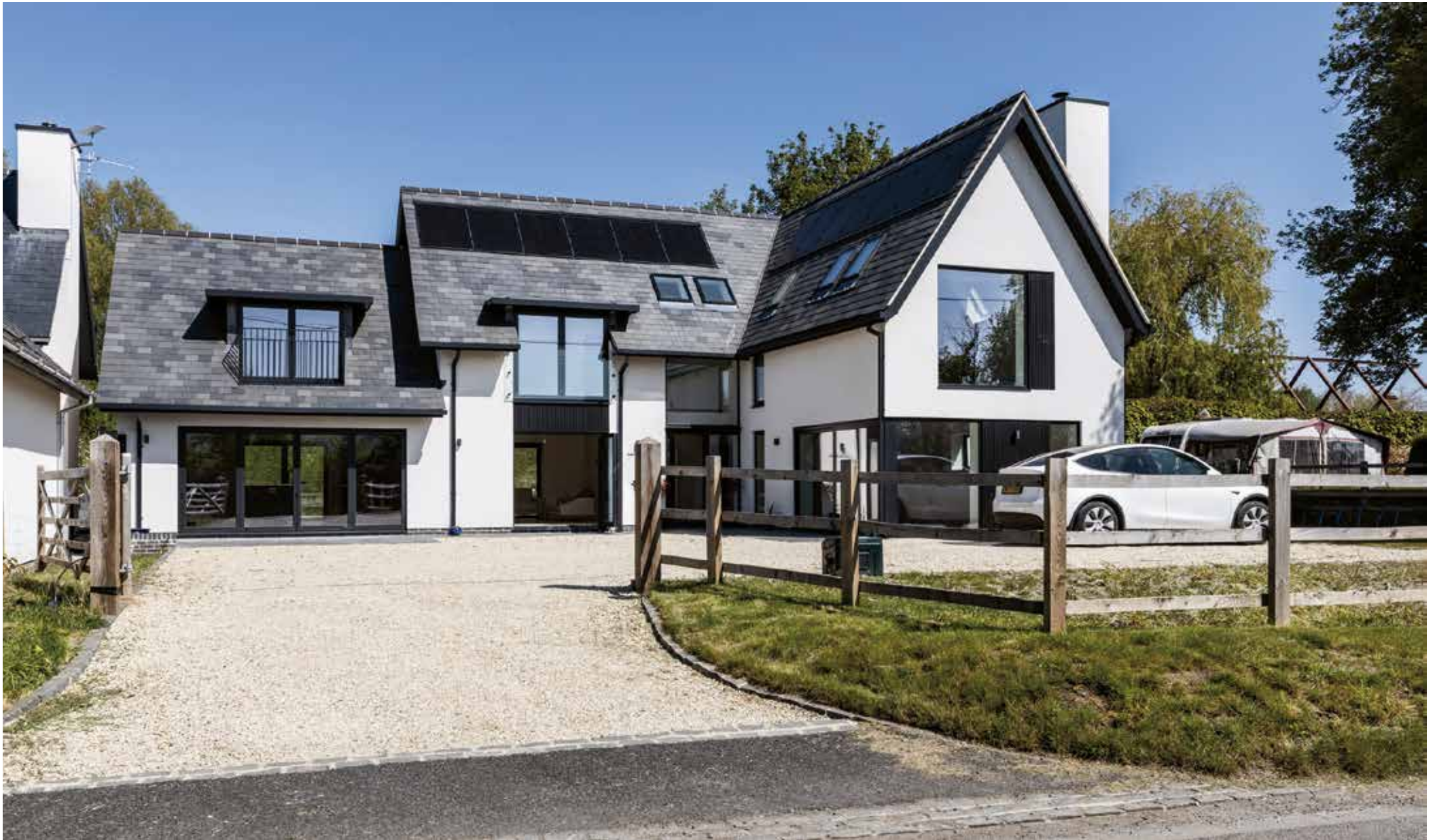
The Voles Retreat Woolstone Road | Uffington | Faringdon | Oxfordshire | SN7 7RG