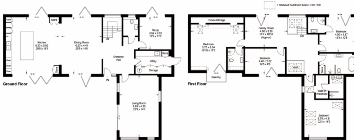
Illustration is for identification purposes only. Measurements and property layout are approximate.