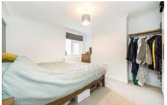
Ommaney Road, SE14