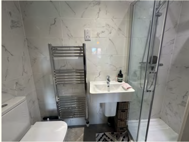
Bedroom 1 En Suite