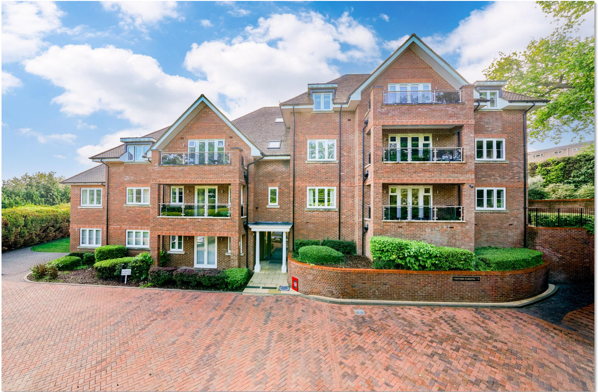
The Glebe Chesham Road, Berkhamsted HP4 3AB