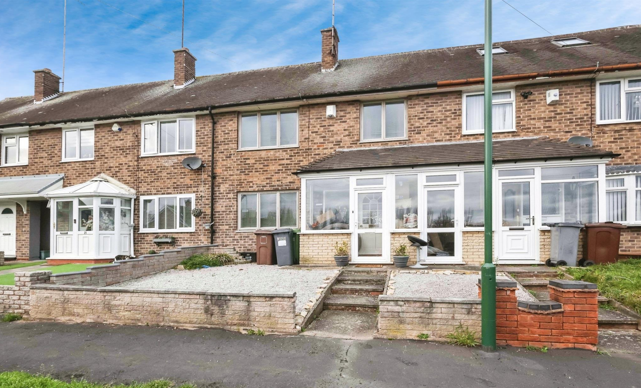
Townshend Grove, Birmingham