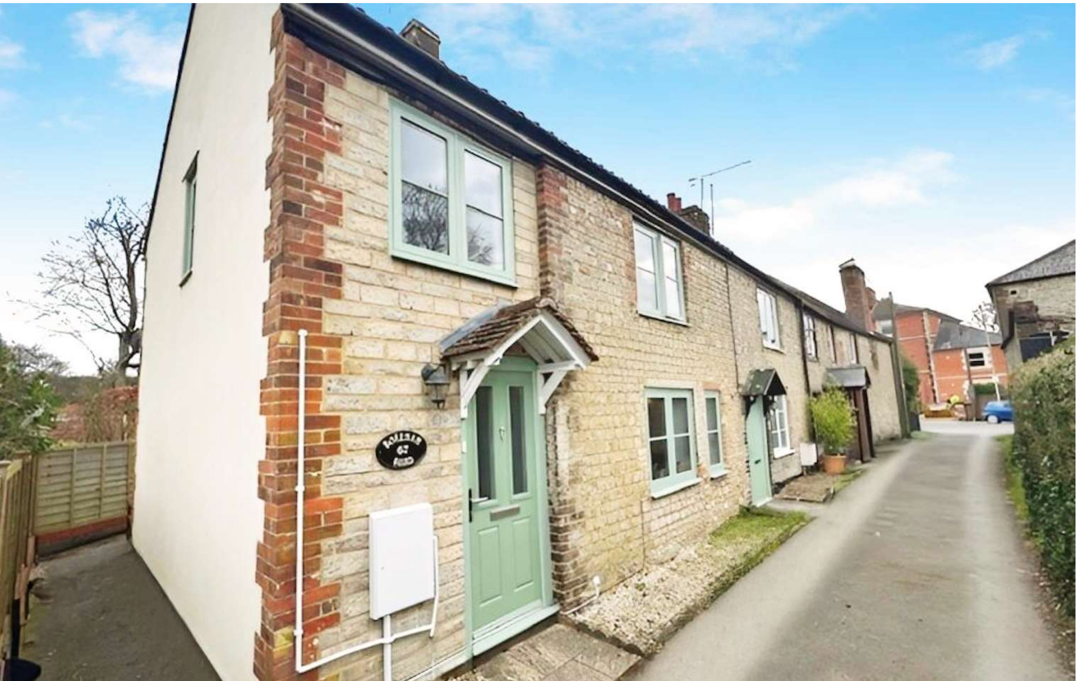
Boreham Road, Warminster