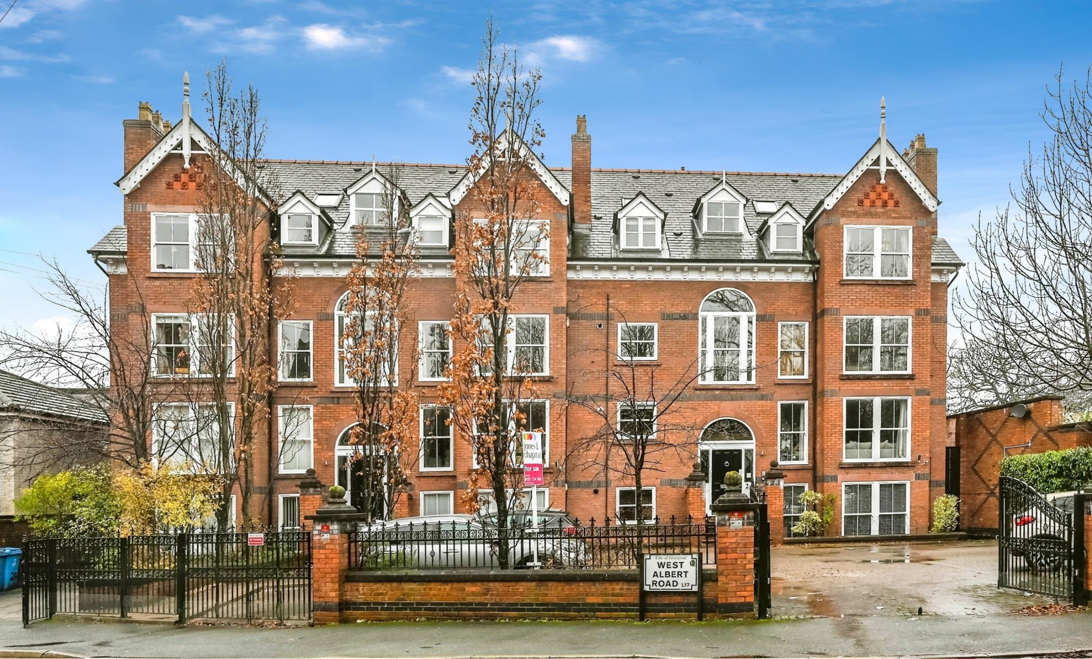
CHURCH VIEW West Albert Road, Liverpool L17 8TJ