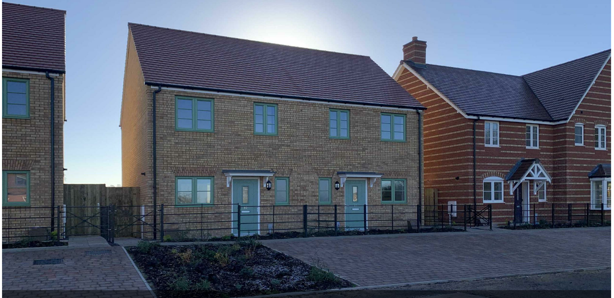
50, Sugar Beet Avenue, Allscott Meads Allscott, Telford, TF6 5FD £950 Per Month