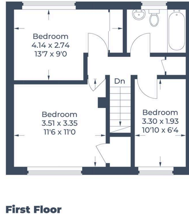
Illustration for identification purposes only, measurements are approximate, not to scale. © CJ Property Marketing Produced for Chandlers