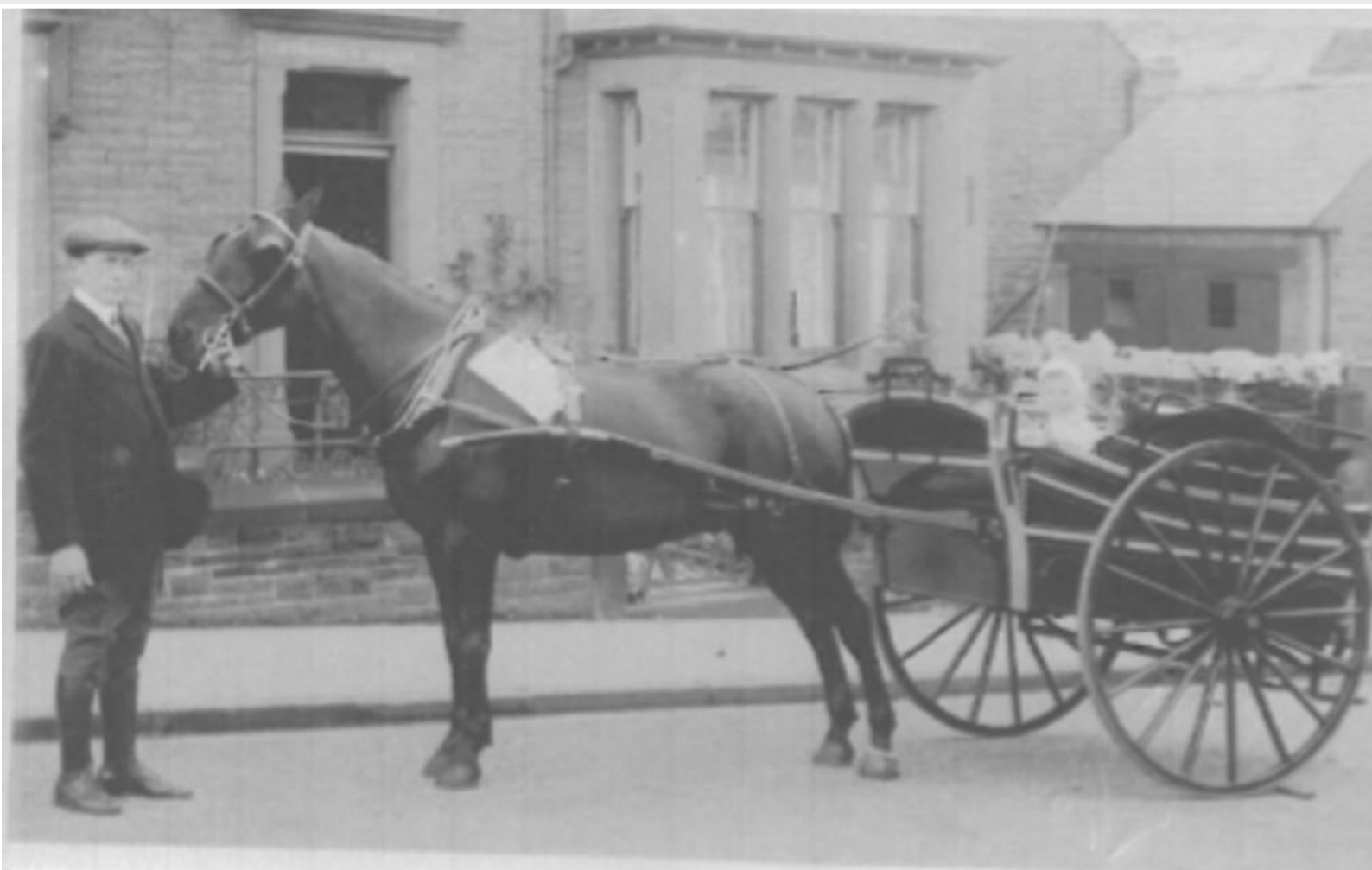
Old Property Photo

Request a Viewing Online or Call 01768 593593