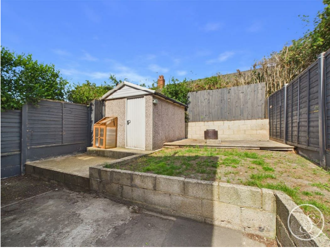
Ample storage space.