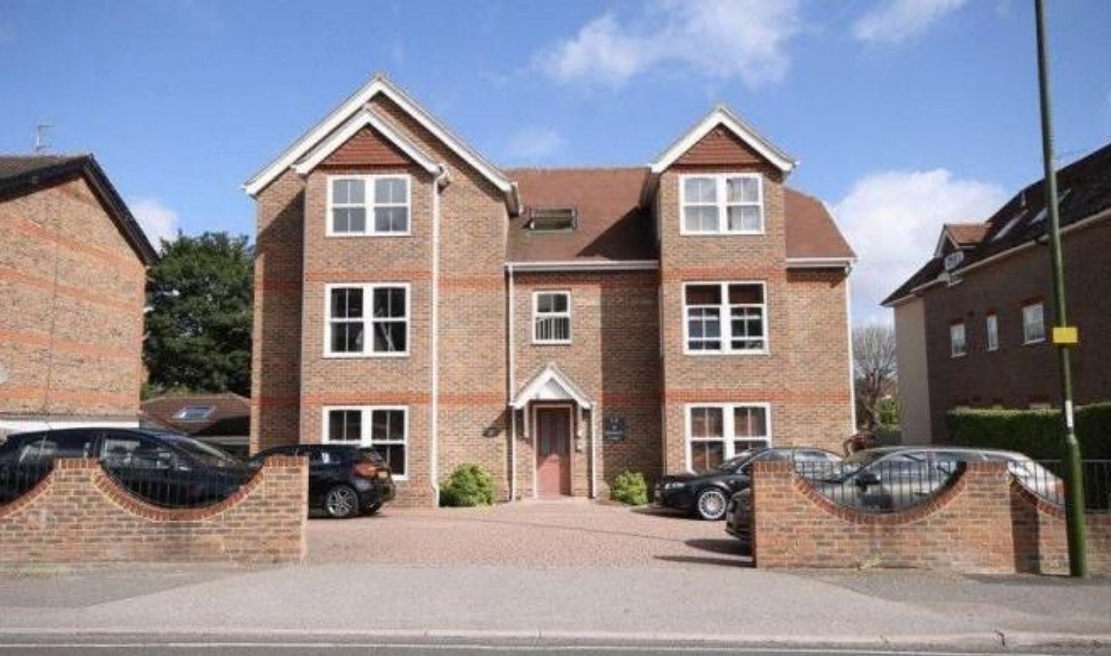
Flat 4, St Richards Court 47 Sydney Road, Haywards Heath, RH16 1QD