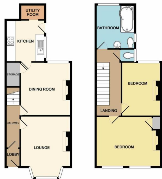
GROUND FLOOR APPROX. FLOOR AREA 475 SQ.FT. (44.2 SQ.M.)