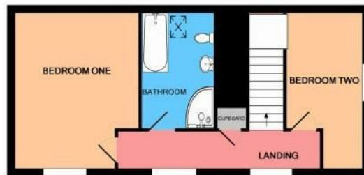
1ST FLOOR APPROX. FLOOR AREA 493 SQ.FT. (45.8 SQ.M.)