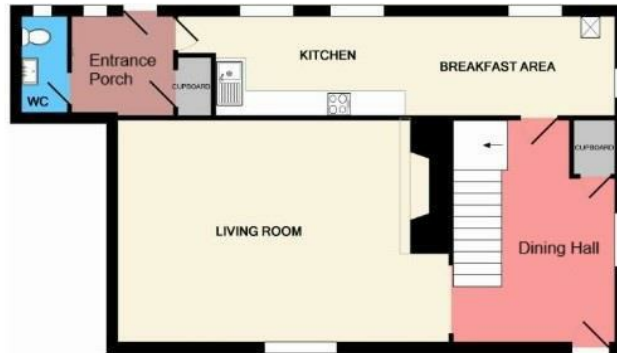
GROUND FLOOR APPROX. FLOOR AREA 794 SQ.FT. (73.7 SQ.M.)