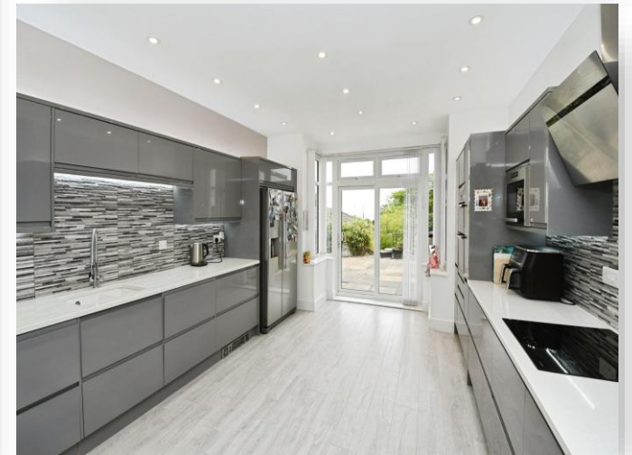
St. Andrews Drive, Skegness PE25 1DL