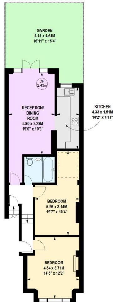
761 sq ft Ground Floor

This floor plan is a representation for guidance purposes only, not for valuation. Any figure is approximate and must not be relied on as a statement of fact. Copyright of Wyatt Dixon Homes