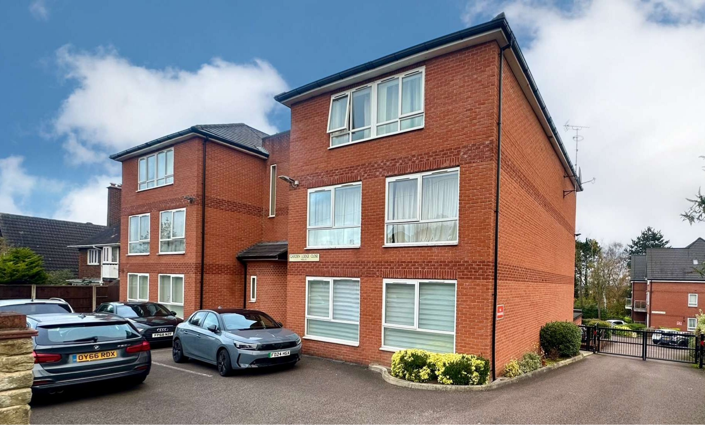
Garden Lodge Close, Derby DE23 6DD