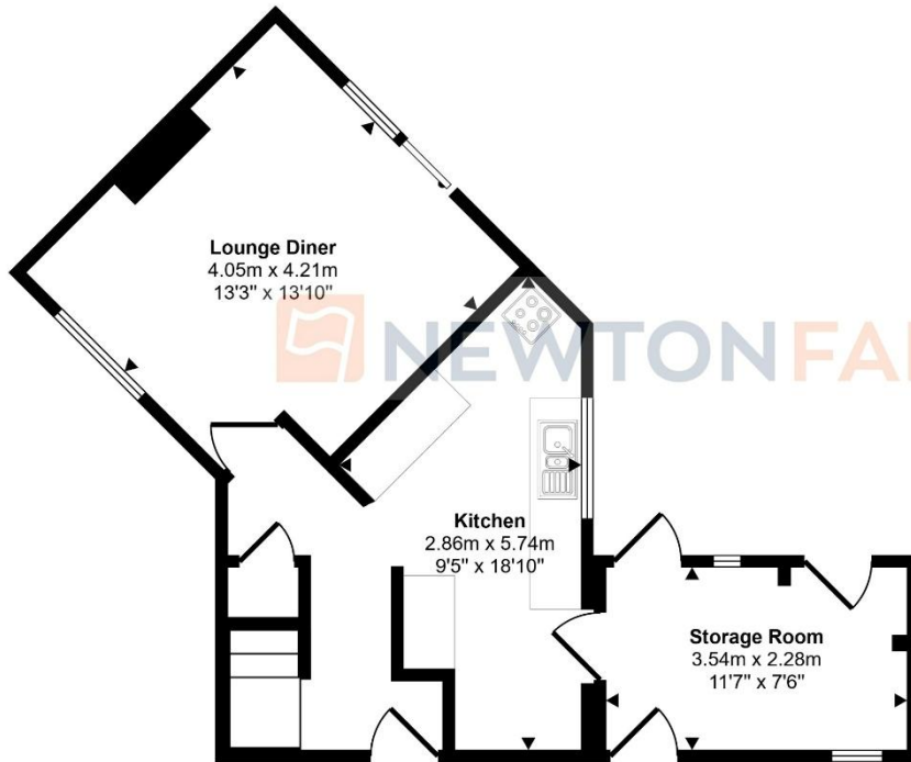
Ground Floor Approx 44 sq m / 473 sq ft

Approx Gross Internal Area 79 sq m / 854 sq ft