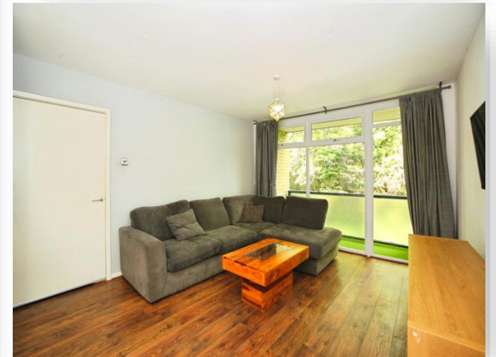
Cogan Court, Cogan Pill Road, Llandough, Penarth, CF64 2NF