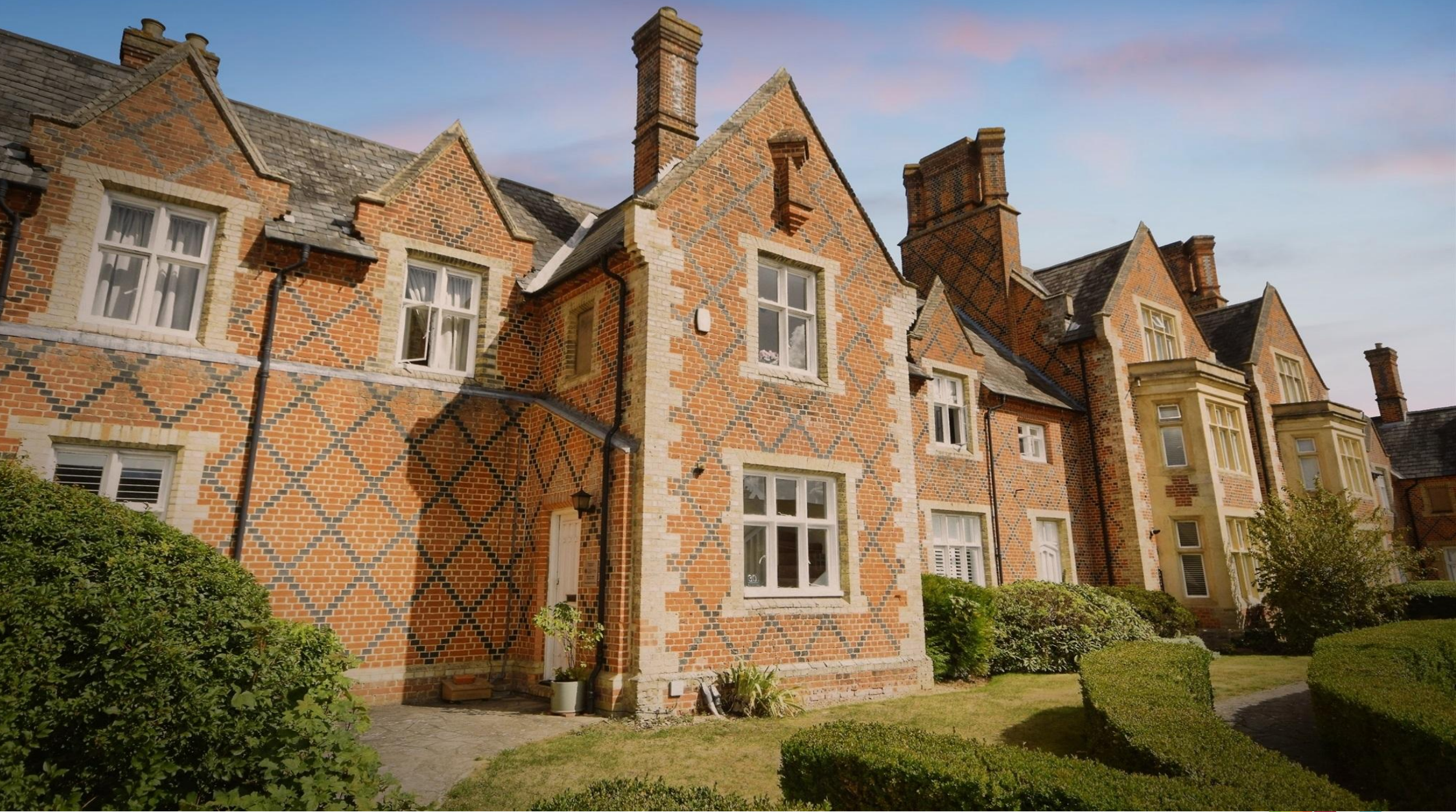
Grey Lady Place, Billericay, CM11 1LU