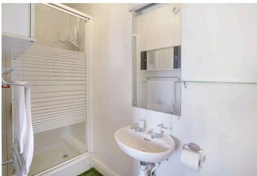
3rd Floor 61.2 sq.m. (659 sq.ft.) approx.

Teignmouth is a popular seaside resort on a stretch of red sandstone along the South Devon Coast. It is a coastal town that has a historic port and working harbour, with a Victorian Pier and promenade. There are sandy sea and river beaches excellent for sailing and water sports with two sailing clubs and a diving school.