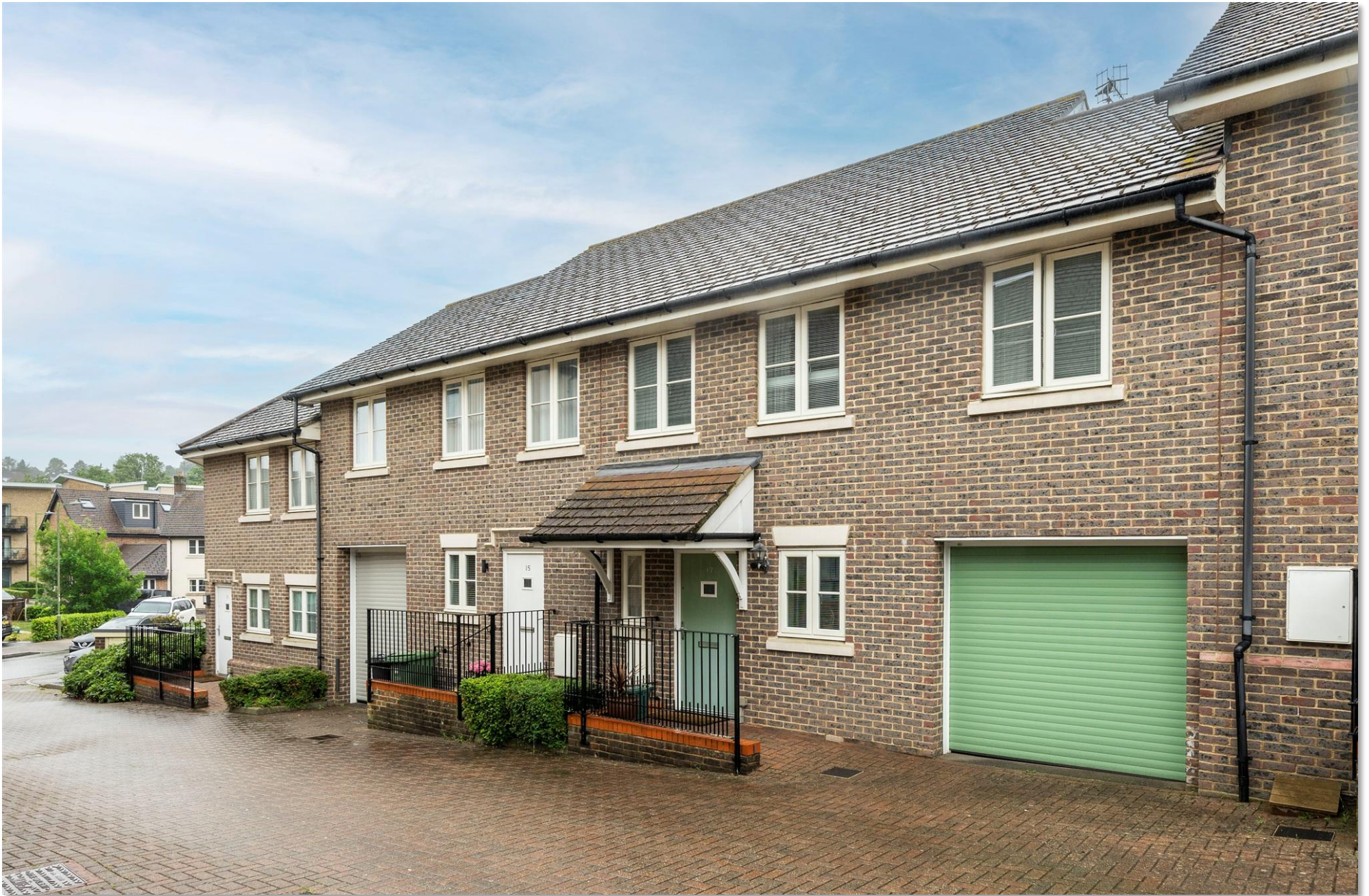
Sheldon Way, Berkhamsted HP4 1FG