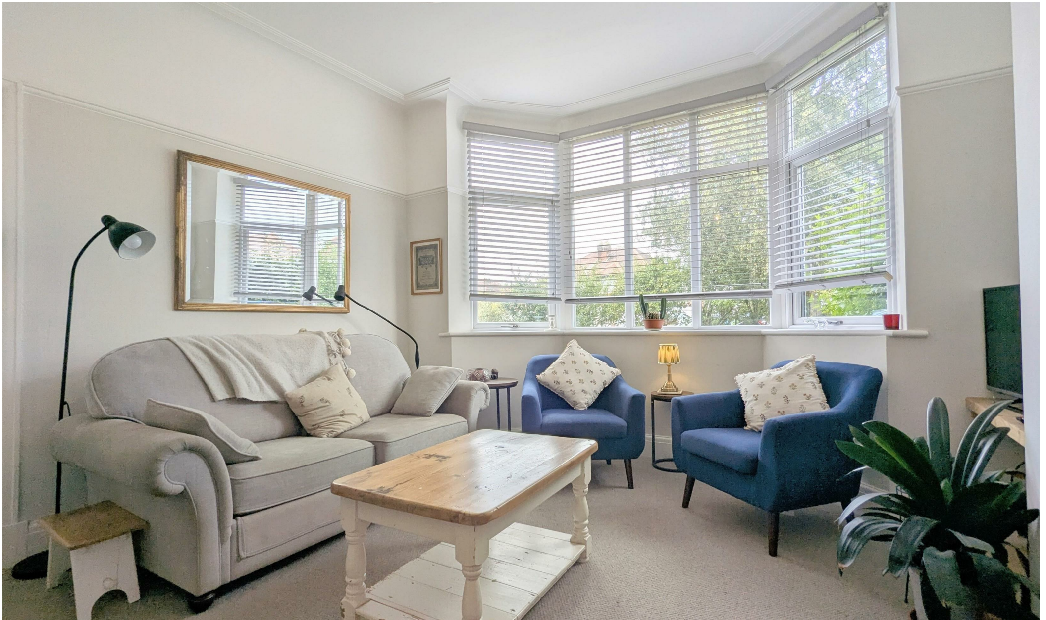
GOLF | CHARLOTTE HOUSE, GROUND FLOOR, 35-37 HOGHTON STREET, SOUTHPORT, MERSEYSIDE, PR9 0NS