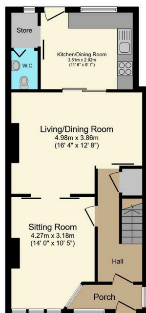
Ground Floor Floor area 54.9 sq.m. (591 sq.ft.)