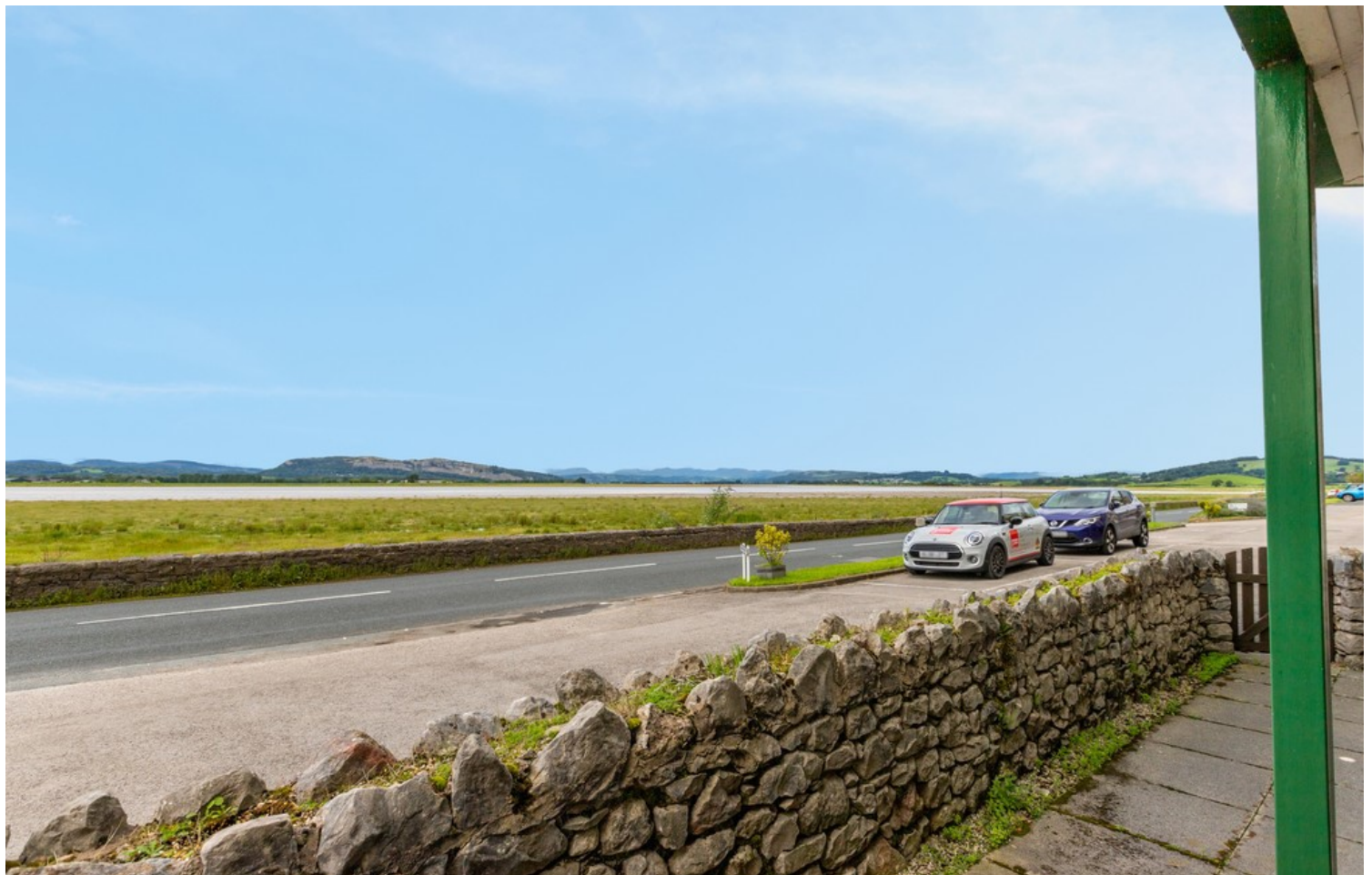
Views From Front of Apartment