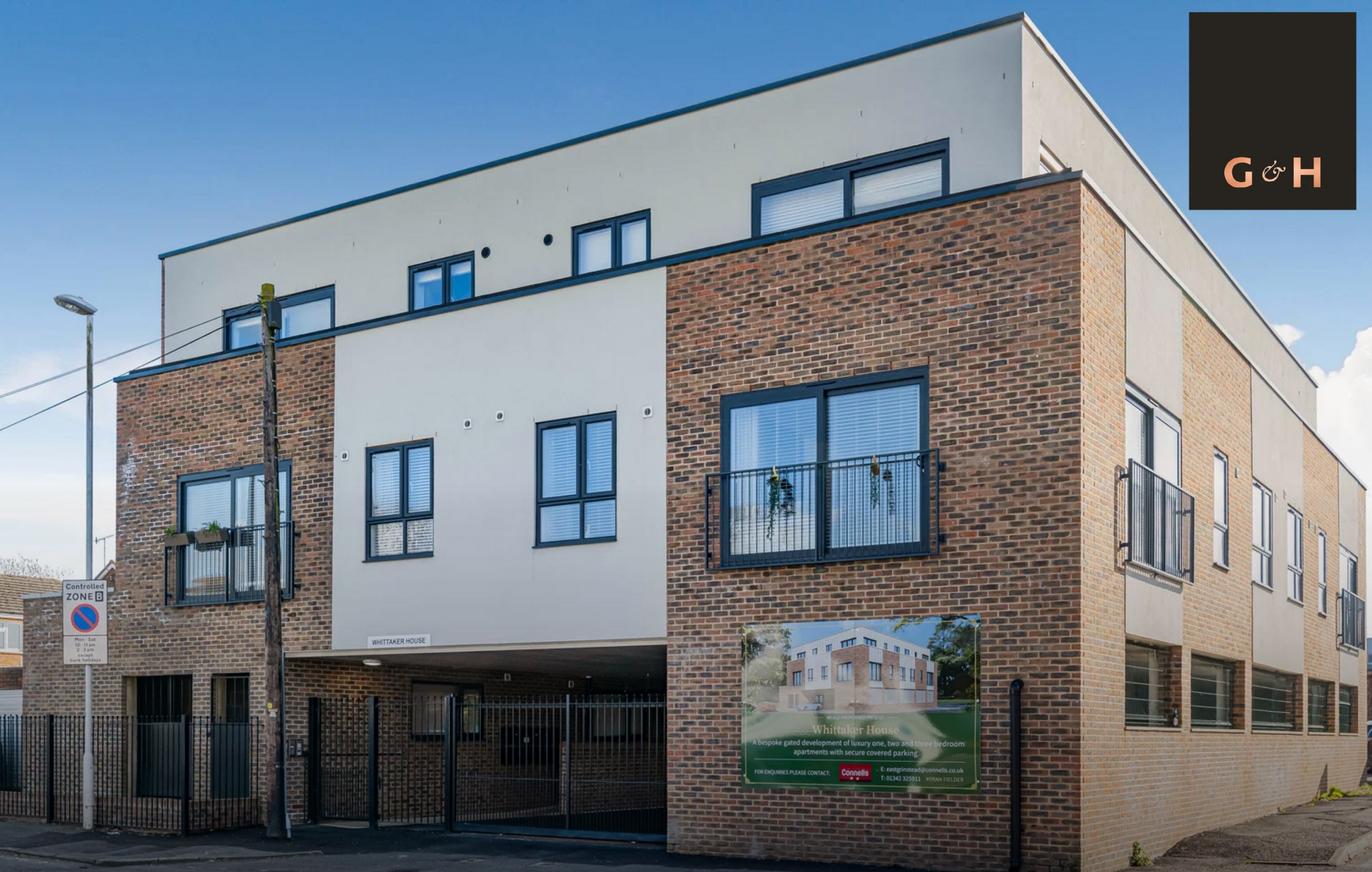
Whittaker House East Grinstead