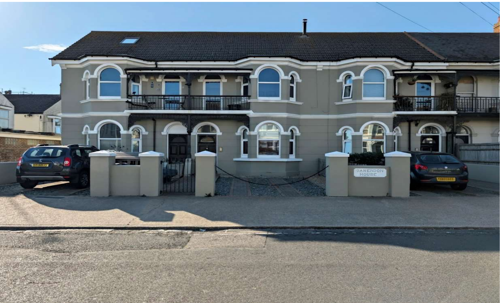
Garendon House Navarino Road,Worthing BN11 2NG