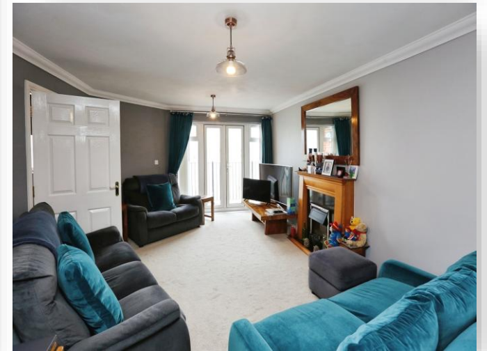
Sussex Court Vanguard Road, Gosport PO12 4FF