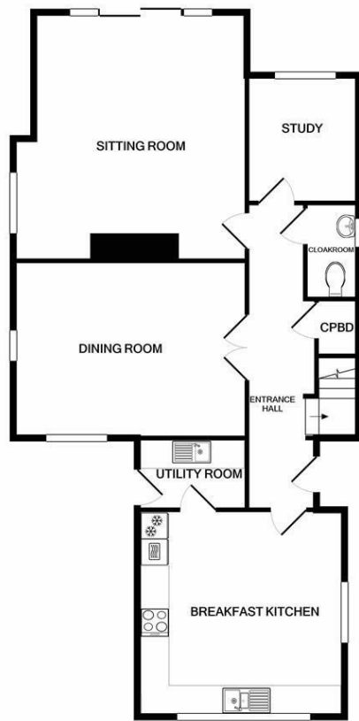
GROUND FLOOR APPROX. FLOOR AREA 946 SQ.FT. (87.9 SQ.M.)