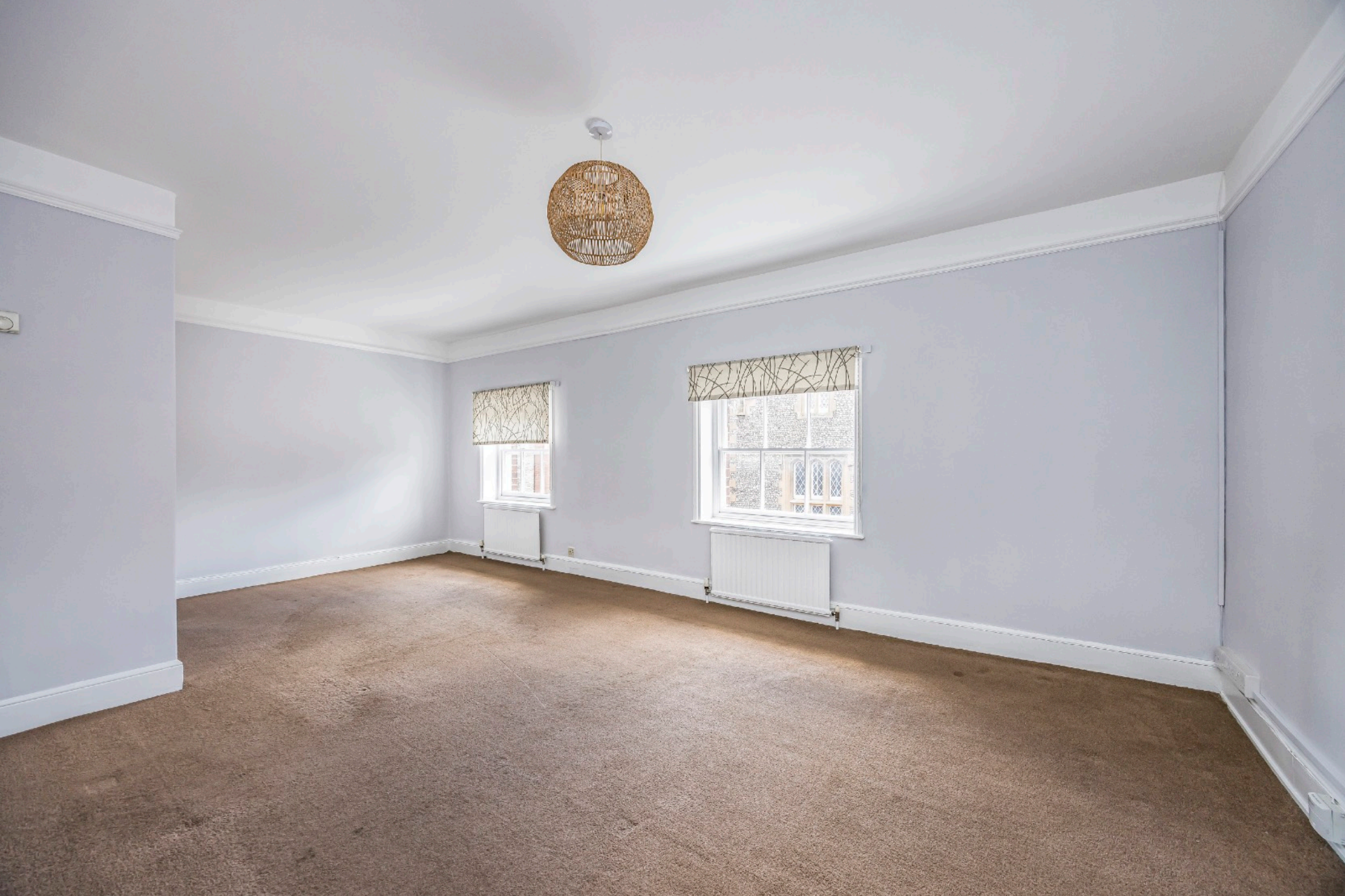
SECOND FLOOR APARTMENT