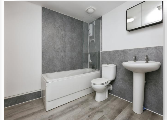
Forton Road, Gosport, PO12 3HW